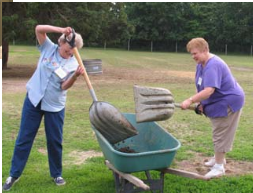
Photo highlights , clockwise from upper left: spinning, drumming, alpacas, pooper scoopering, boating, praying.

“You moved me to tears – to deeper awareness of gloom and hope.”