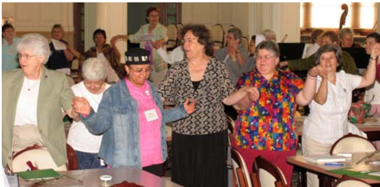
Providence Event participants celebrate with a Jubilent Closing to Liturgy

Thank you, most Provident God, for your unending love. Thank you for creating us and for gifting us with the ability to ponder and appreciate our universe. Thank you for being Providence.