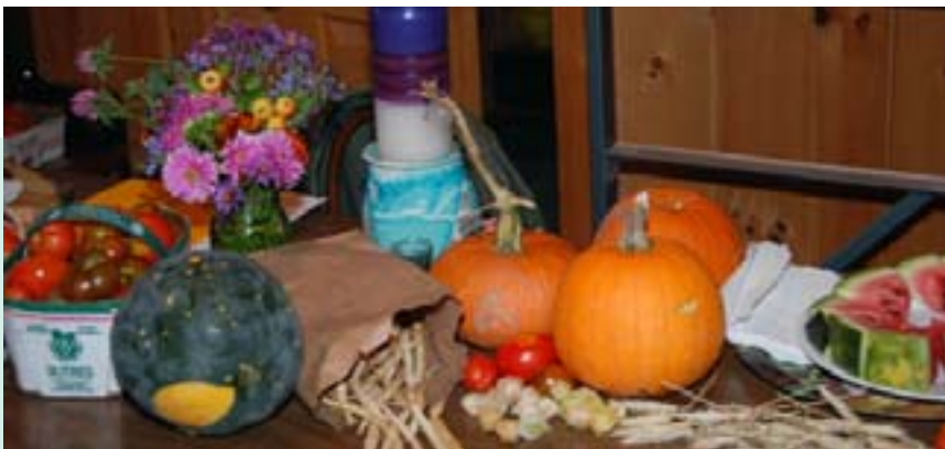
The beautiful bounty of the Autumn harvest at left marks the beginning of a period for thanksgiving and celebration.