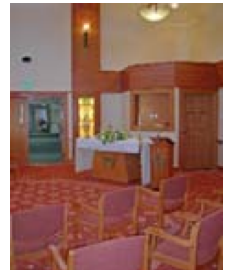
Above, from left, a blessing from the Bishop, exterior view of Mary's Meadow's "small house" concept, and interior of the central shared Chapel.

The Sisters of Providence of Holyoke held a Blessing and Dedication Ceremony for their newest ministry Mary's Meadow at Providence Place on Tues., Sept. 15, at 10:30 a.m. outside The Garden, one of four newly constructed houses at 12 Gamelin Street.