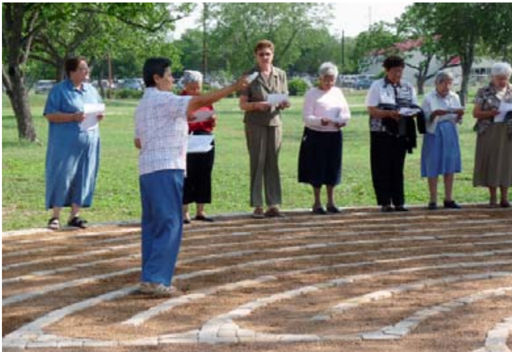
The MCDPs bless their newly constructed prayer labyrinth this past May.

MISSIONARY CATECHISTS OF DIVINE PROVIDENCE, SAN ANTONIO, TEXAS